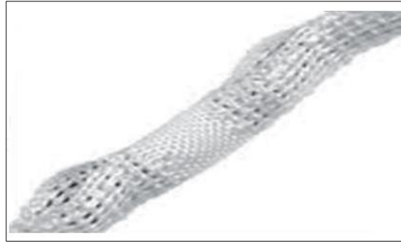
Figure 4 Knitted structure for a cardiovascular implant