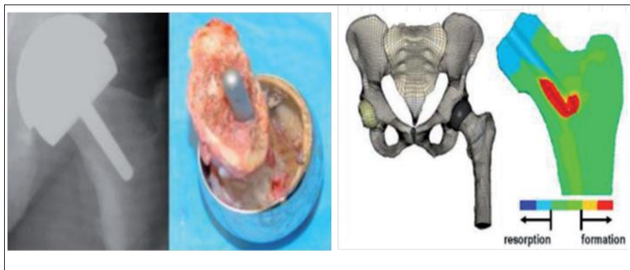
Figure 3 Hip bone implants

As the patient population continues to increase and significant progress is made in analytic and healing approaches, vascular illnesses are gaining prominence in both general and clinical settings. Consequently, there is a pressing demand for vascular grafts.