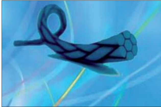
Figure 1 Nylon monofilament suture