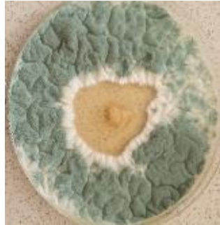
Figure 5b Radial growth Inhibition by garlic paste on P. chrysogenum (front view)