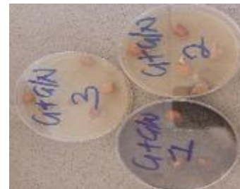
Figure 4d Groundnut+ GAE 100% (4DAI)