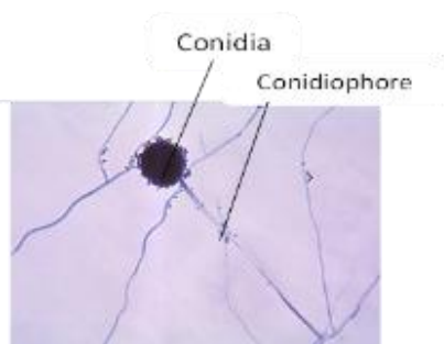
Figure 1 Microscopic view of Aspergillus niger (Mag. x200)

generally had an obvious effect on reducing the incidence of fungal species on each of the treated seeds as shown in Figures 4a-h.