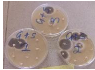
Figure 4h Sorghum + GAE 100% (4DAI)