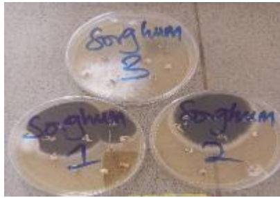
Figure 4g Untreated Sorghum seeds (4 DAI)