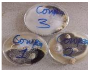
Figure 4a Untreated cowpea seeds (4 DAI)