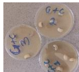
Figure 4b Cowpea + GAE 100% (4DAI)