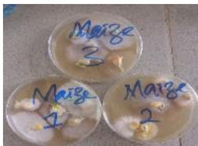
Figure 4e Untreated Maize seeds (4 DAI)