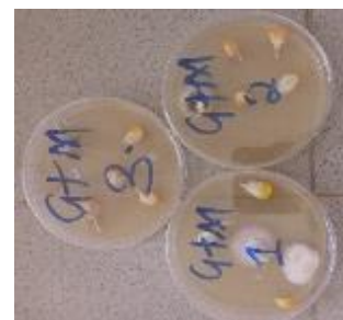
Figure 4f Maize + GAE100% (4DAI)