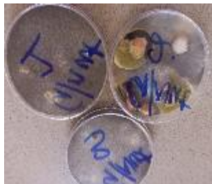
Figure 4c Untreated Groundnut seeds (4 DAI)