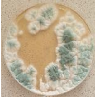
Figure 5a Radial growth Inhibition by garlic aqueous extract on P. chrysogenum (front view)