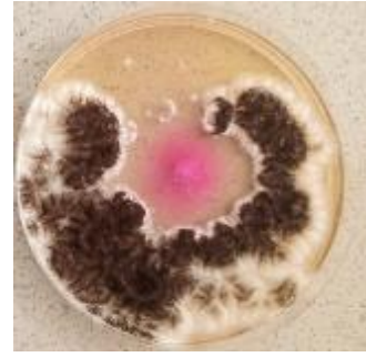
Figure 5c Radial growth Inhibition by Thiram® on A. niger (front)