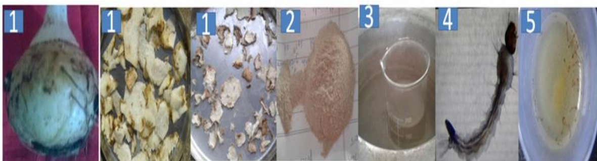
Figure 1 Photograph showing different stages in methods of extraction and application of corm powder extract

Arisaema murrayi (sapkanda) corm sundried for 3-5 days. Sundried corm grinded to make powder .5gm of powder mix in 200ml ethanol and boiled up to ethanol evaporate .After evaporation of ethanol residue was applied on mosquito larvae. After application of this extract larvae died within 4 hrs (Figure 1).